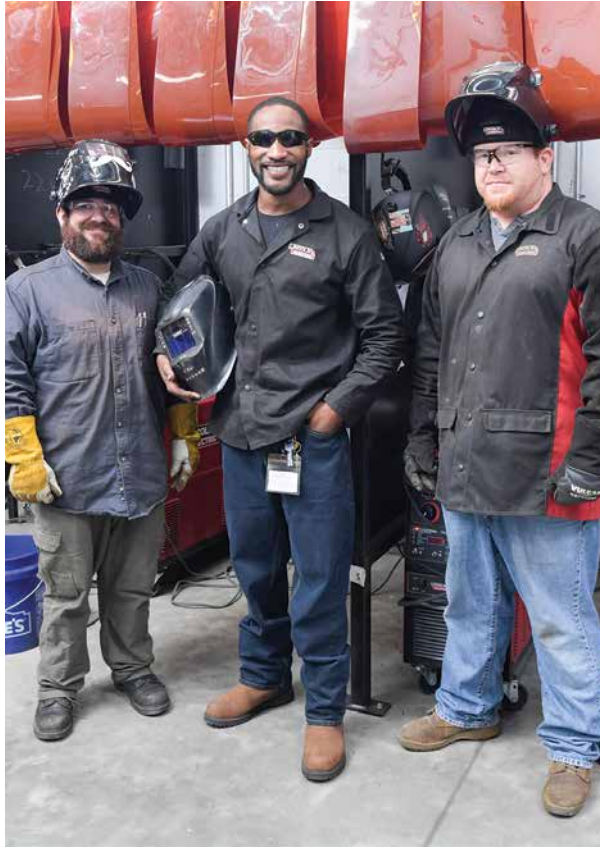
Students completing the welding program at Treasure Coast Technical College can find well-paying jobs right out of school.