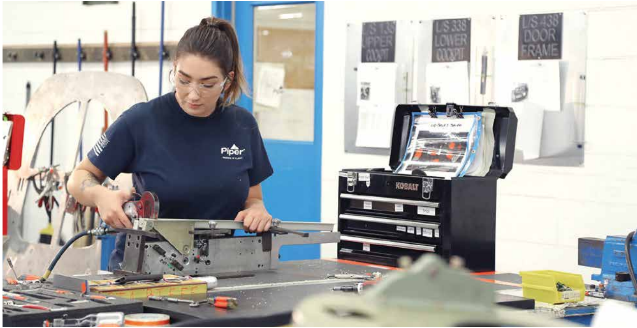
Indian River State College and Piper Aircraft collaborate in an apprenticeship program in which students shadow skilled aircraft assembly workers while completing related coursework.