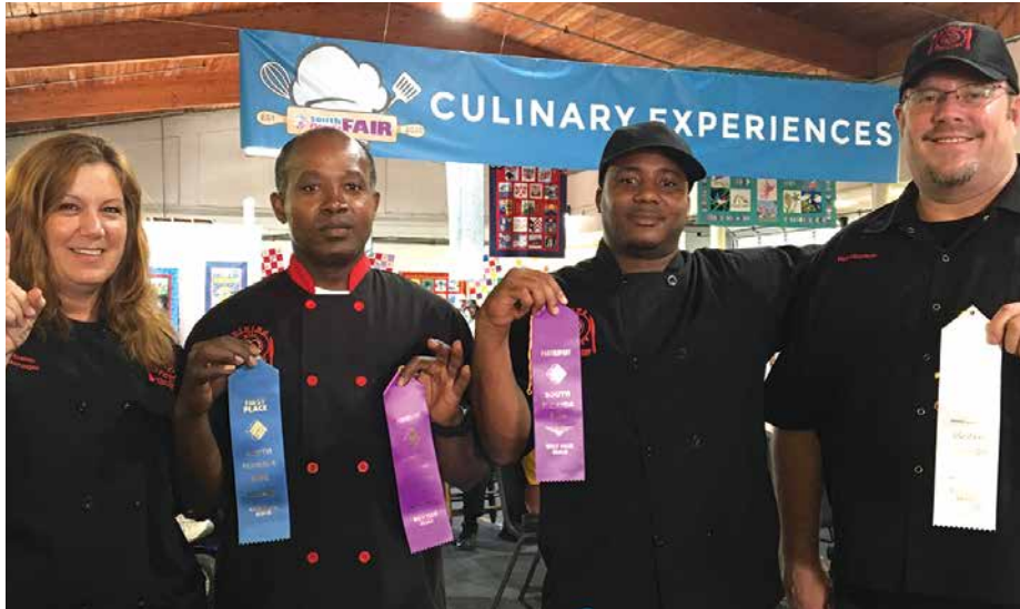
Award-winning foods from the talented chefs in the Dining with Dignity program are available around town from the Dignity Food Truck.