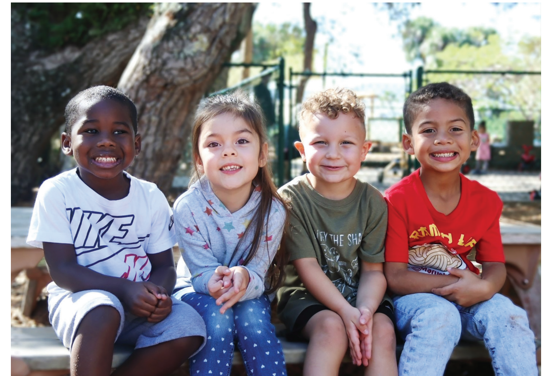
Childcare Resources trains their educators to promote social and emotional learning with their students.

We set expectations of our school district leaders to meet the highest standards for safety, community, and excellence. If we truly want progress, however, we should afford them the same. But the one standard that is missing is perhaps the greatest: kindness. 🌟