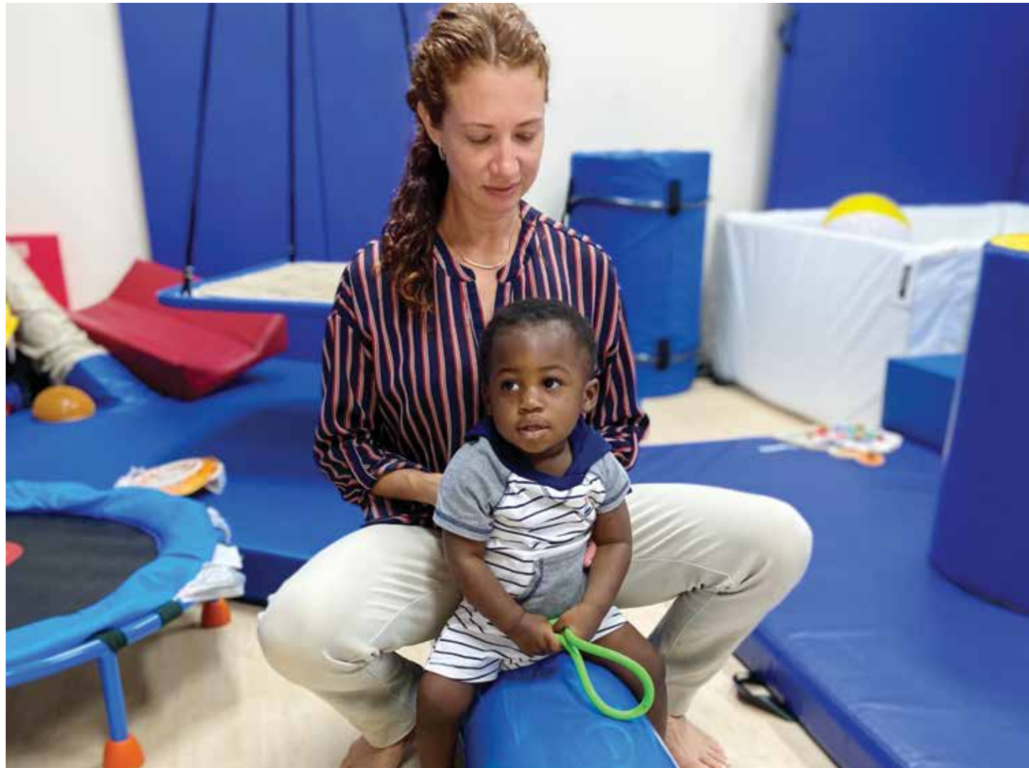
Childcare Resources relies on making connections in the community through fostering empathy with residents who want to help local children.

the work of an actual human being. ChatGPT is one application that has been getting a significant amount of attention lately. Could it be the answer to my writer's block? I was about to find out.