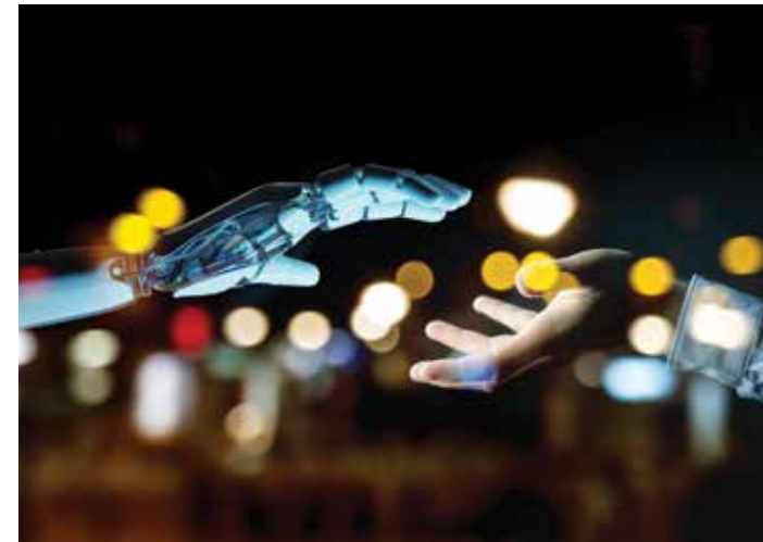
Use of ChatGPT in some circumstances can be helpful, but it's not human.

quite a bit to do with the charities that people choose to support as volunteers or donors. It is a person's authentic engagement or investment that makes these acts of kindness and generosity special.