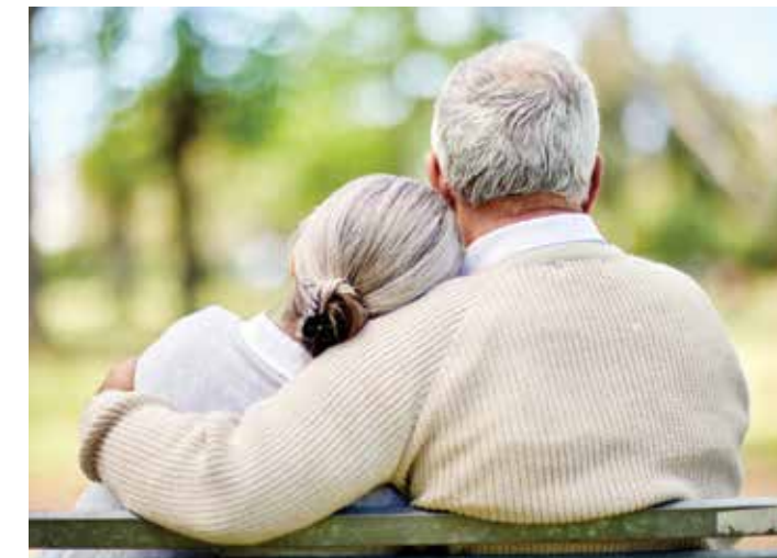
Connections between people cannot be replaced with artificial intelligence.

Charitable giving plays a pivotal role in addressing societal challenges. Charitable donations fuel organizations and initiatives that tackle pressing issues such as poverty, education, healthcare, environmental conservation, and more. By supporting these causes, individuals become active participants in shaping