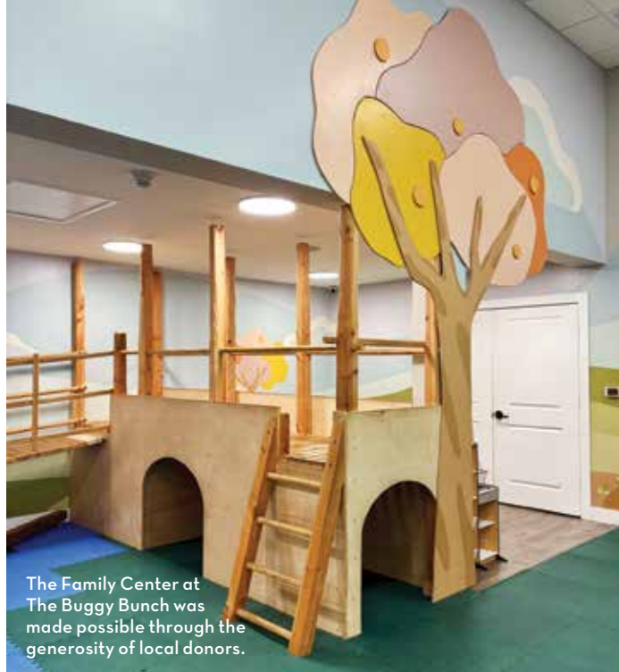
The Family Center at The Buggy Bunch was made possible through the generosity of local donors.

“This is the story we see all the time. Housing instability does not discriminate. It can touch teachers, nurses, small